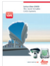
Leica Viva GNSS Product brochure