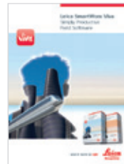
Leica SmartWorx Viva Product brochure