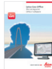
Leica Viva LGO Product brochure