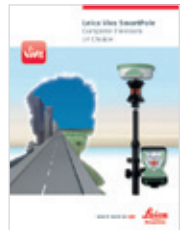
Leica Viva SmartPole Product brochure