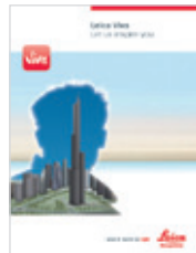
Leica Viva Overview brochure

Illustrations, descriptions and technical data are not binding. All rights reserved. Printed in Switzerland – Copyright Leica Geosystems AG, Heerbrugg, Switzerland, 2009. 774504en-us – 01.14 – galledia