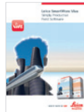
Leica SmartWorx Viva Product brochure