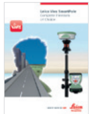
Leica Viva SmartPole Product brochure