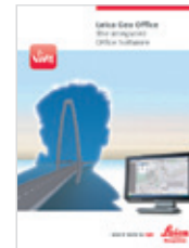
Leica Viva LGO Product brochure