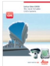
Leica Viva GNSS Product brochure