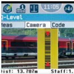
DIGITAL CAMERA AIMING