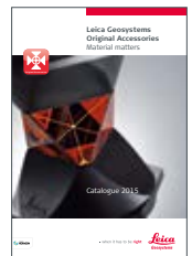
Leica Original Accessories