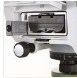
EASY DATA TRANSFER