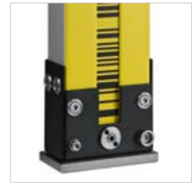
USE STANDARD INVAR STAFF