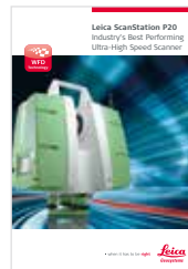
Leica ScanStation P20 Industry's Best Performing Ultra-High Speed Scanner