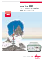
Leica Viva GS25 GNSS Surveying Receiver Peak Performance

Illustrations, descriptions and technical specifications are not binding and may change. Printed in Switzerland – Copyright Leica Geosystems AG, Heerbrugg, Switzerland, 2015. 837206en - 09.15 - INT