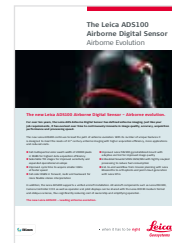
Leica ADS100 Airborne Digital Sensor Airborne Evolution